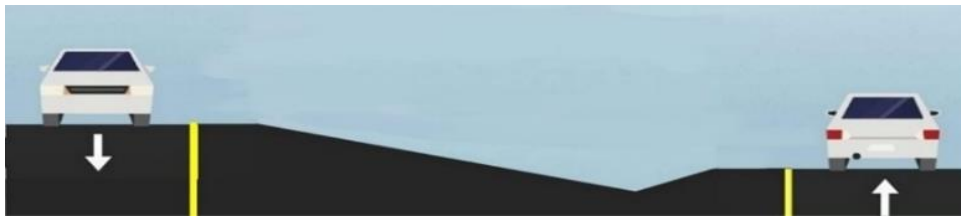
Exhibit 1232-3 Median Section without Median Barrier